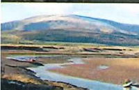
DUDDON ESTUARY AND BLACK COMBE