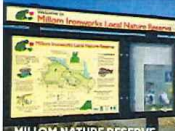
MILLOM NATURE RESERVE