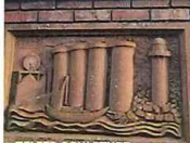
TELFER SCULPTURE, MILLOM SQUARE