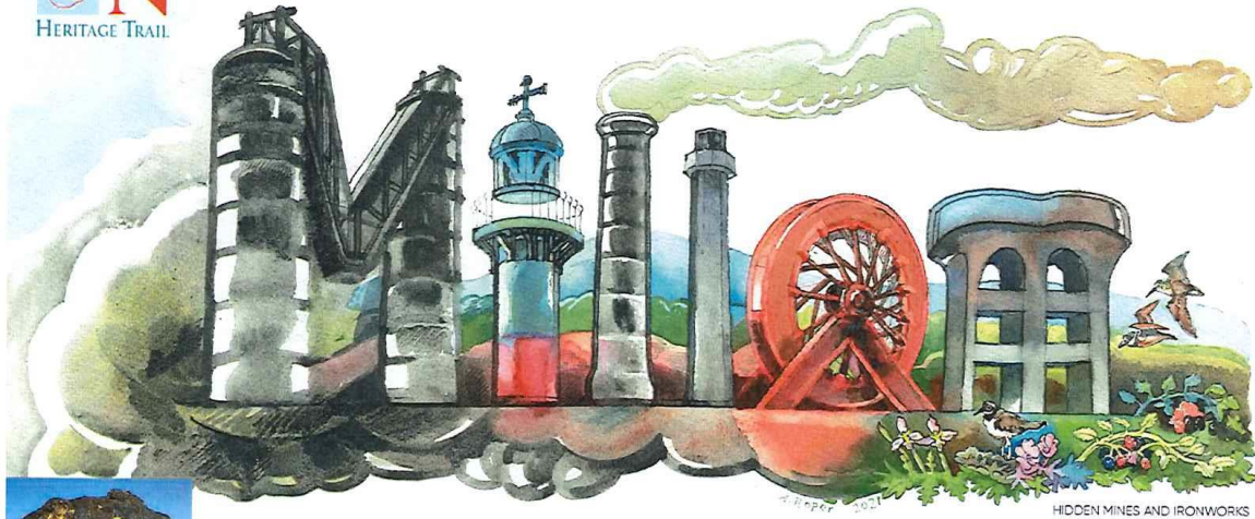
HIDDEN MINES AND IRONWORKS